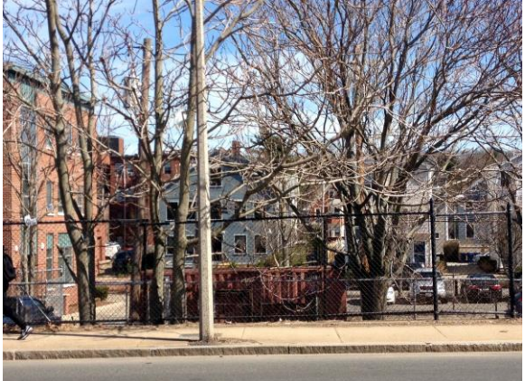
View of Site sunken "dog-leg" from end Gordon St