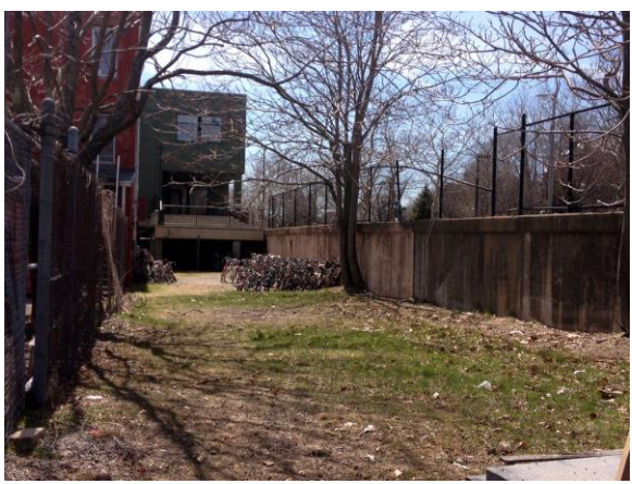
View of Site "dog-leg" along Amory St