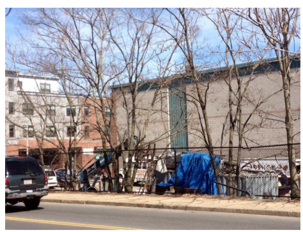
View across Site from Amory St toward Green St