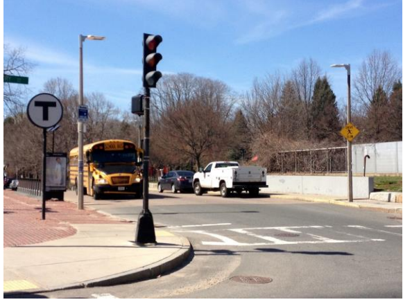
View of Green St toward Centre St