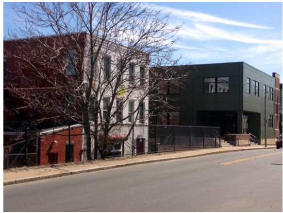
View of Site sunken "dog-leg" from Amory St