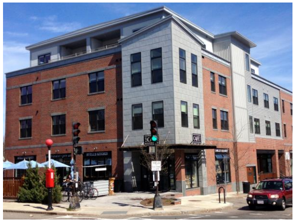
View of Bartlett Sq I at Green/Amory intersection