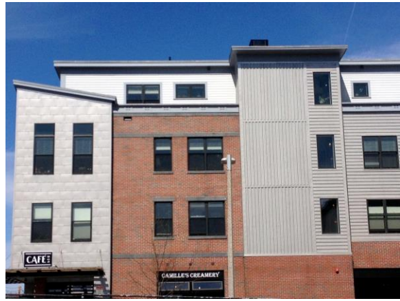
View of BSq 1 from BSq 2 Site at Green St