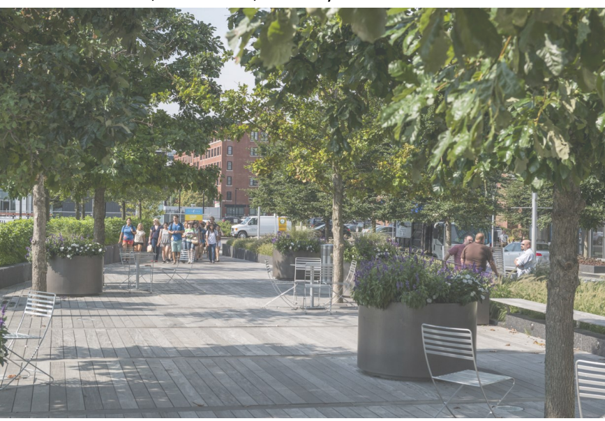
One Marina Park Drive, South Boston Waterfront