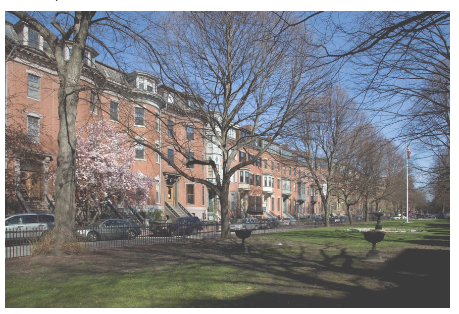
Union Park, South End