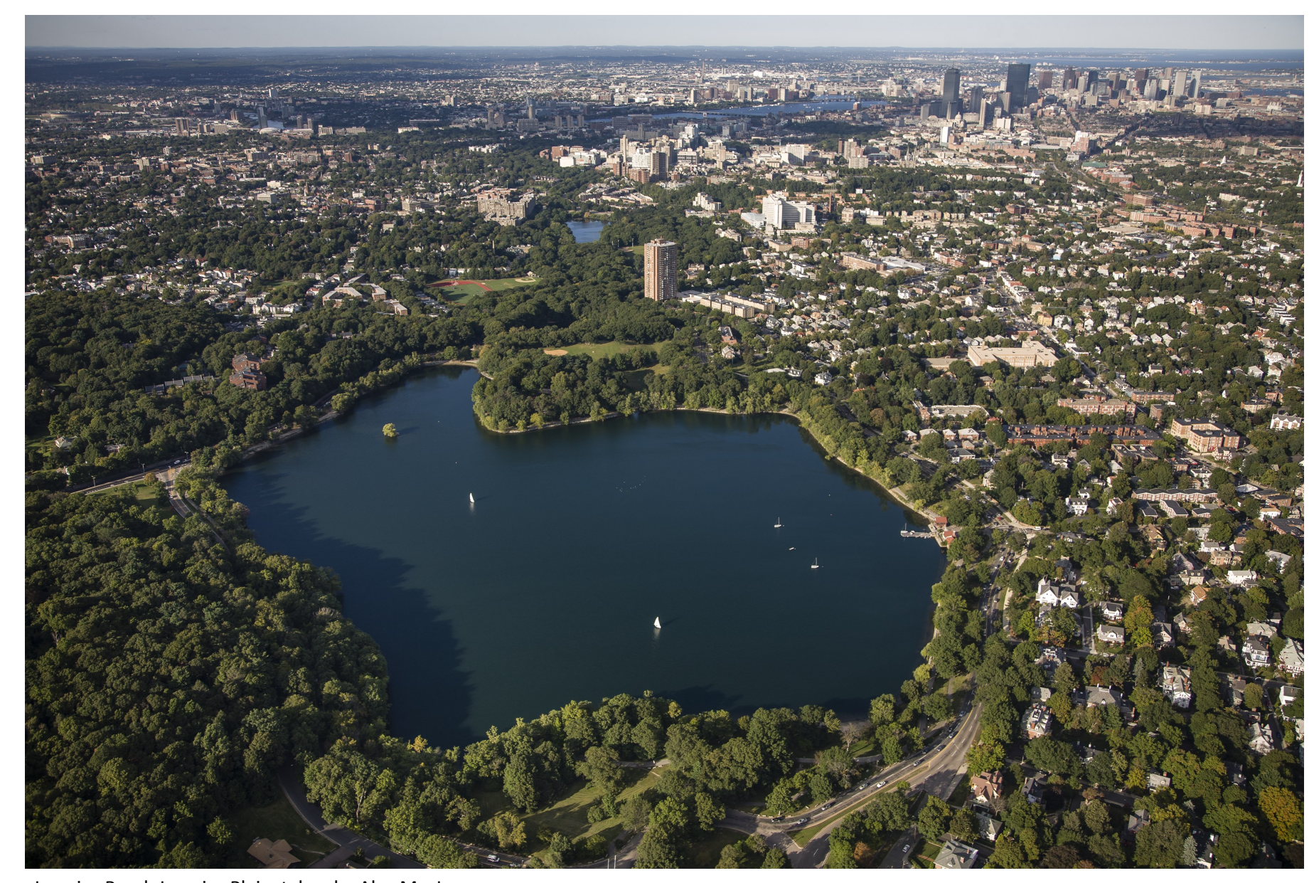
Jamaica Pond, Jamaica Plain