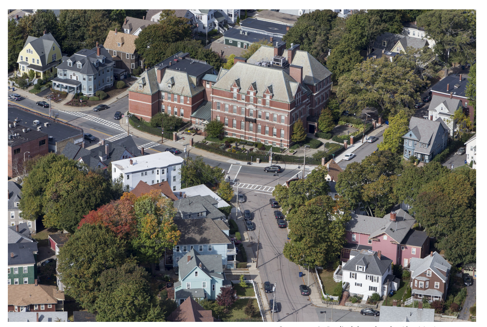
Structures in Roslindale

Lastly, due to data limitations, the neighborhoods of Chinatown, Leather District, and Downtown were combined into "Downtown" for all ACS analyses. The same was done with the South End and Bay Village. The consolidated neighborhood is called "South End" for all ACS analyses.